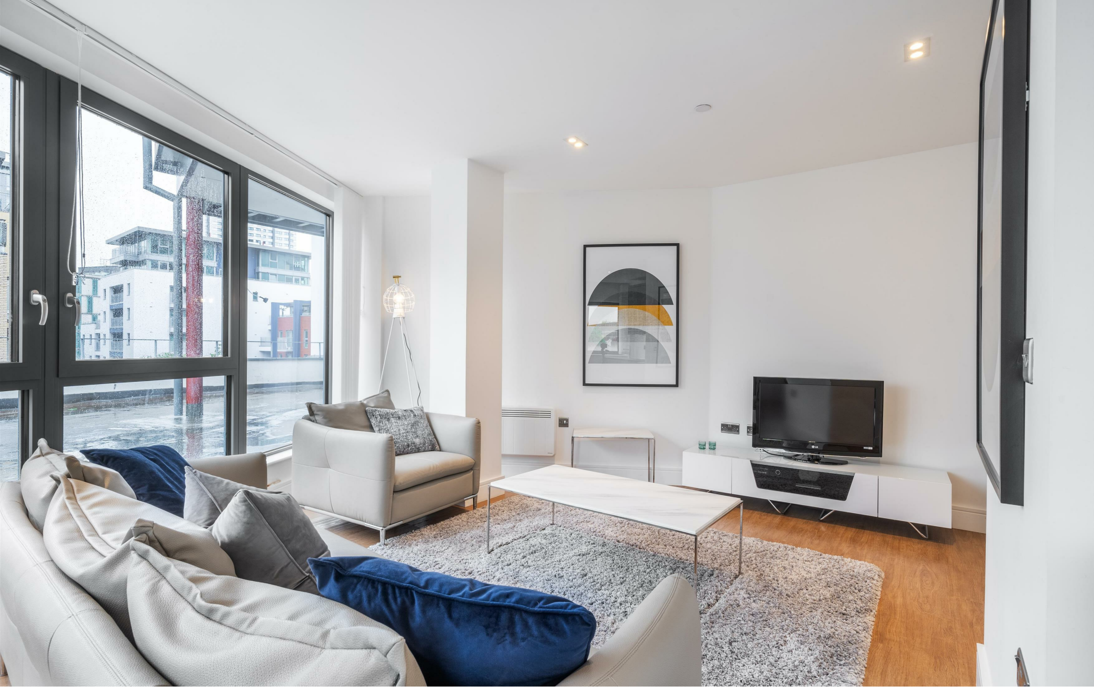
30 Jessica House Wandsworth High Street, London SW18 4RD £485,000